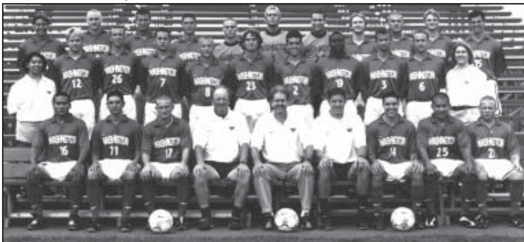
The 2000 Washington squad won the inaugural Pac-10 title for men's soccer.

NOTE: The Huskies competed in the Mountain Pacific Sports Federation from 1992 through 1999. Beginning in 2000, the Huskies competed in the Pacific-10 Conference.