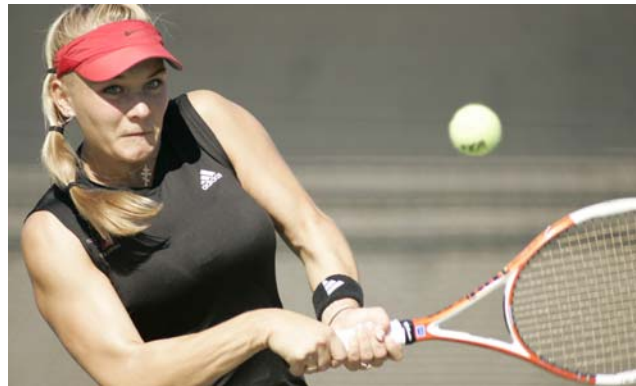
SDSU Athletic Department

Dear ATR : My Life Opened 2 Where Are We Now? (1985) 3 The Matches: 2007 Season 4