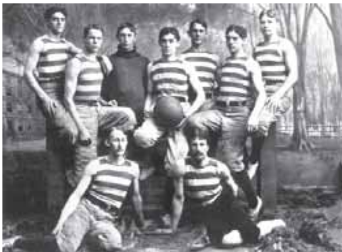
1896-97 Yale team