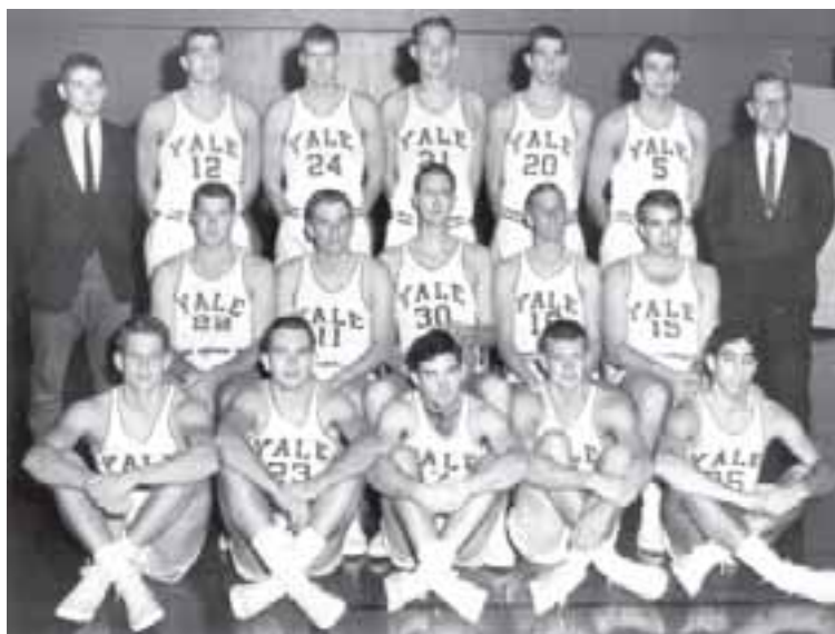
1962-63 Ivy League Championship Team