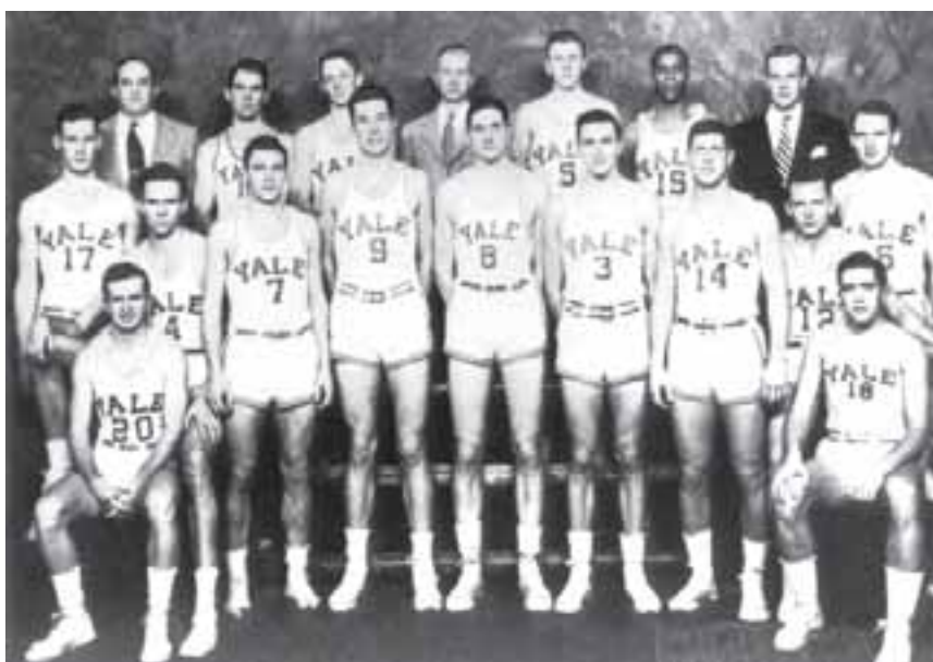
1948-49 EIBL Championship Team