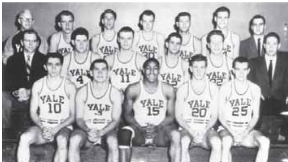
1956-57 Ivy League Championship Team