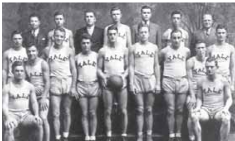
1932-33 EIBL Championship Team