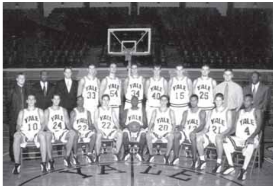
2001-02 Ivy League Championship Team