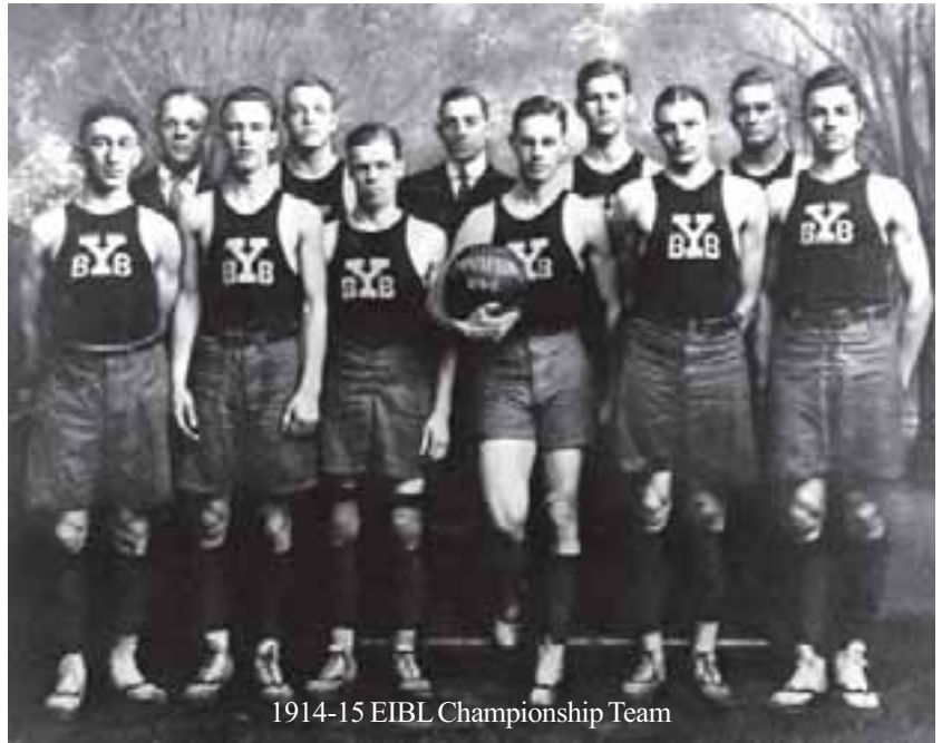
1914-15 EIBL Championship Team

CHAMPIONSHIPS, IVY - Yale has won four Ivy League championships - 1957, 1962, 1963 and 2002. The Bulldogs captured the first official Ivy League title in 1957 as they finished 12-2 and lost to eventual national champion North Carolina, 90-74, in the NCAA East Regional. The 1962 club finished 13-1 in Ivy play, but lost in overtime to Wake Forest, 92-82, in the East Regional. The 1963 team tied Princeton for the Ivy title with an 11-3 record, but fell to the Tigers in a playoff, 65-53. In 2002, the Bulldogs were part of the first three-way tie in Ivy history. Yale beat Princeton 76-60 in the first Ivy playoff game, but fell to Pennsylvania 77-58 in the game to determine the NCAA berth.